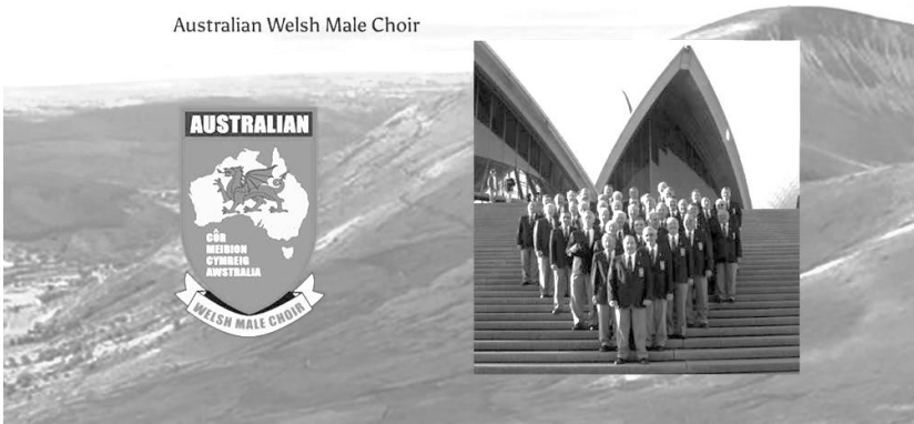
Australian Welsh Male Choir