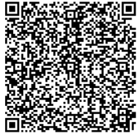
QR code St Peter's