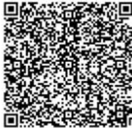
QR code St Peter's