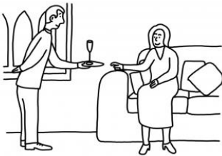
USE OF THE SECRET MEMBERS-ONLY LOUNGE