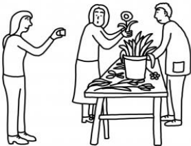
A 'GET OUT OF A ROTA FREE' CARD