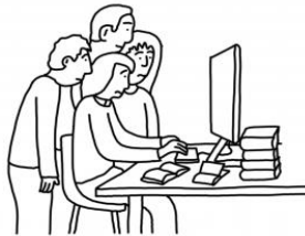
PREVIEWS OF SERMONS THE NIGHT BEFORE RELEASE