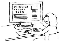
PUNDITS DON'T ALWAYS KNOW WHAT THEY ARE TALKING ABOUT