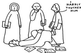
IT IS ACCEPTABLE TO EXAGGERATE INJURIES